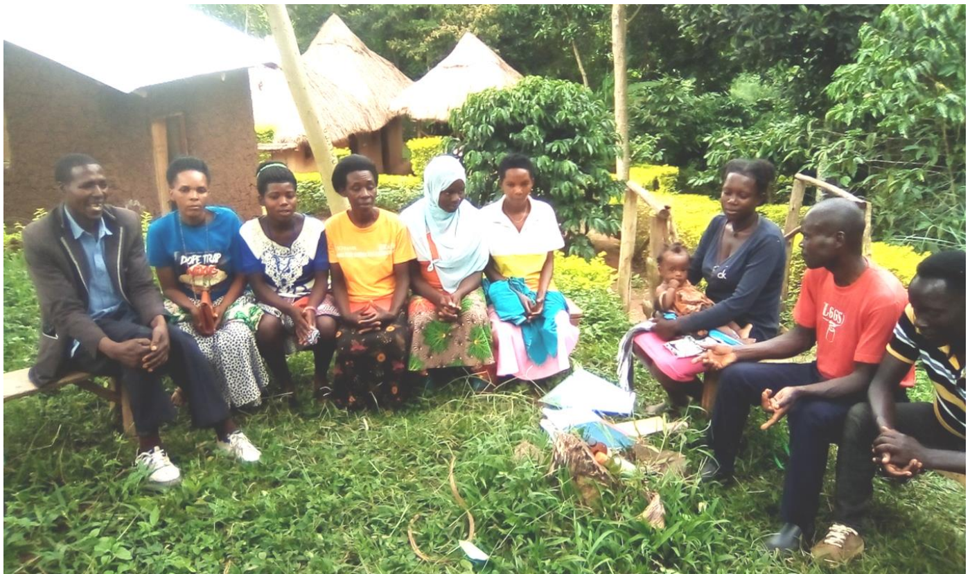
COMMUNITY SENSITIZATION IN BUGAMBAIHE “A” VILLAGE ON ENVIRONMENTAL CONSERVATION MAIRIRWE SUB

And we also managed to partner with ROBUST PHYTOLAB INNOVATION UGANDA the trains persons in various skills like herbal medicine, poultry, bee keeping etc. which are currently stationed at our office (BUTECOP). So far 16 individuals have acquired different skills from different innovations.