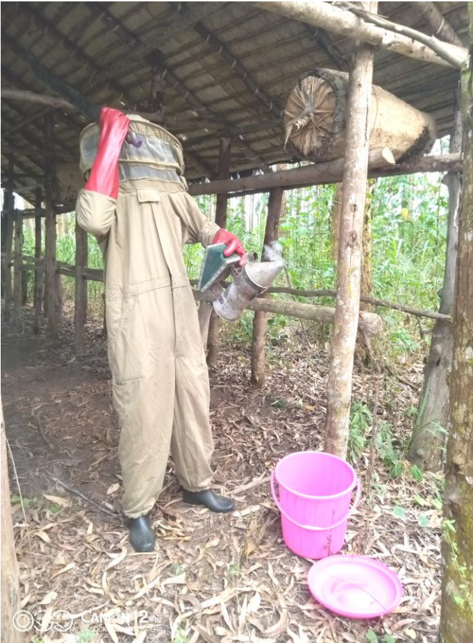
PHOTO SHOWING BEE KEEPING BUTECOP PROJECT